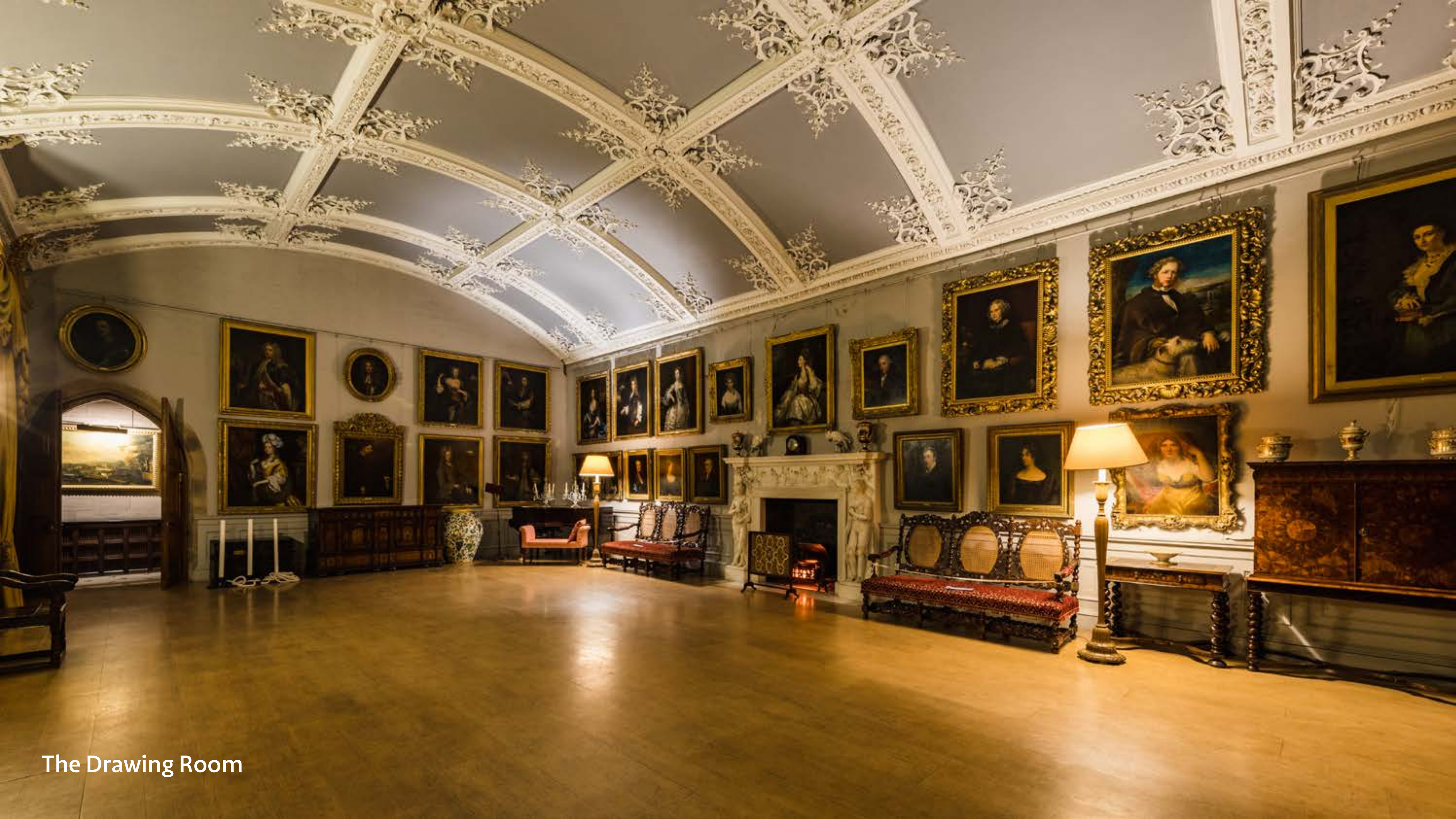
The Drawing Room