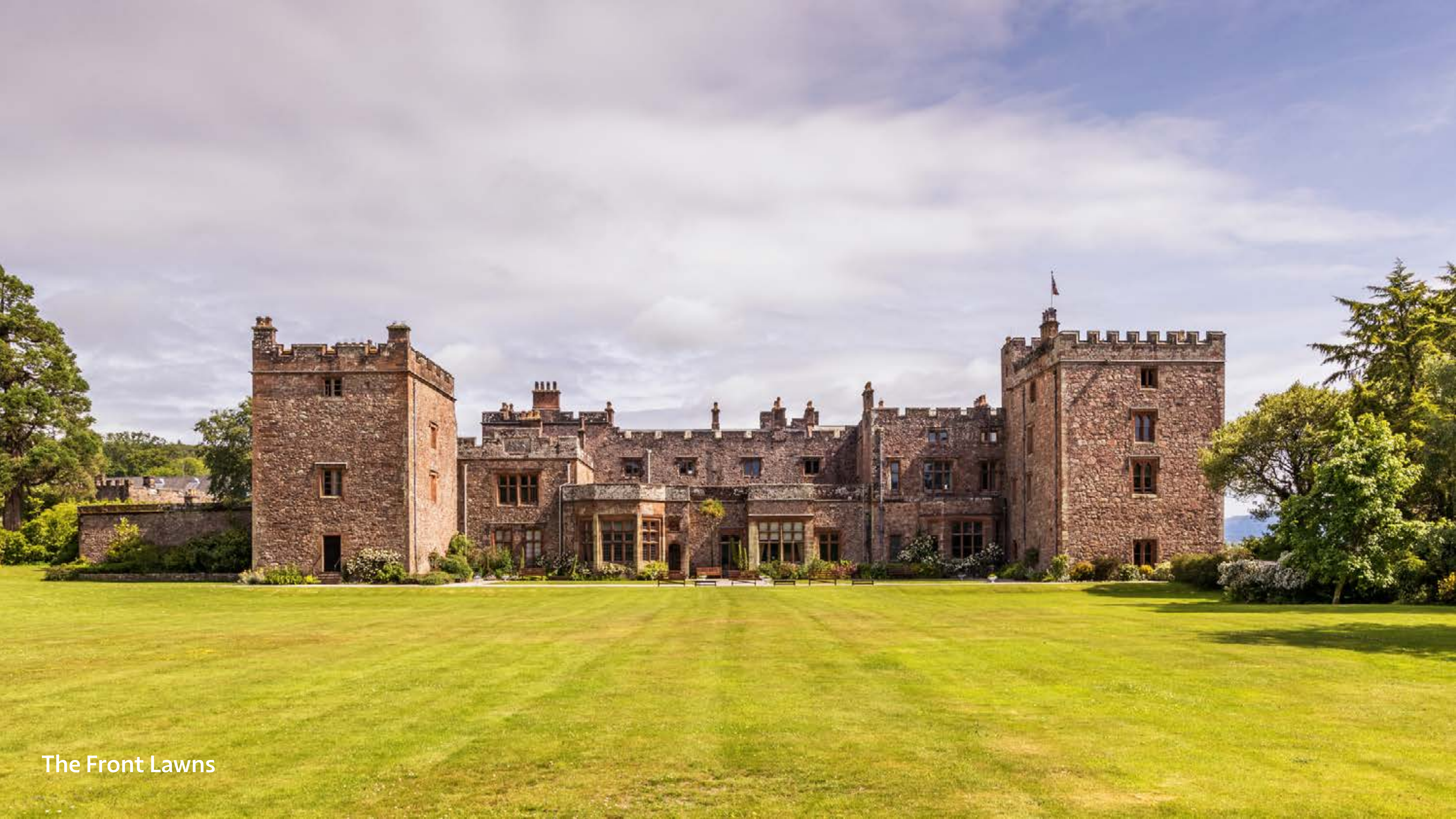
The Front Lawns