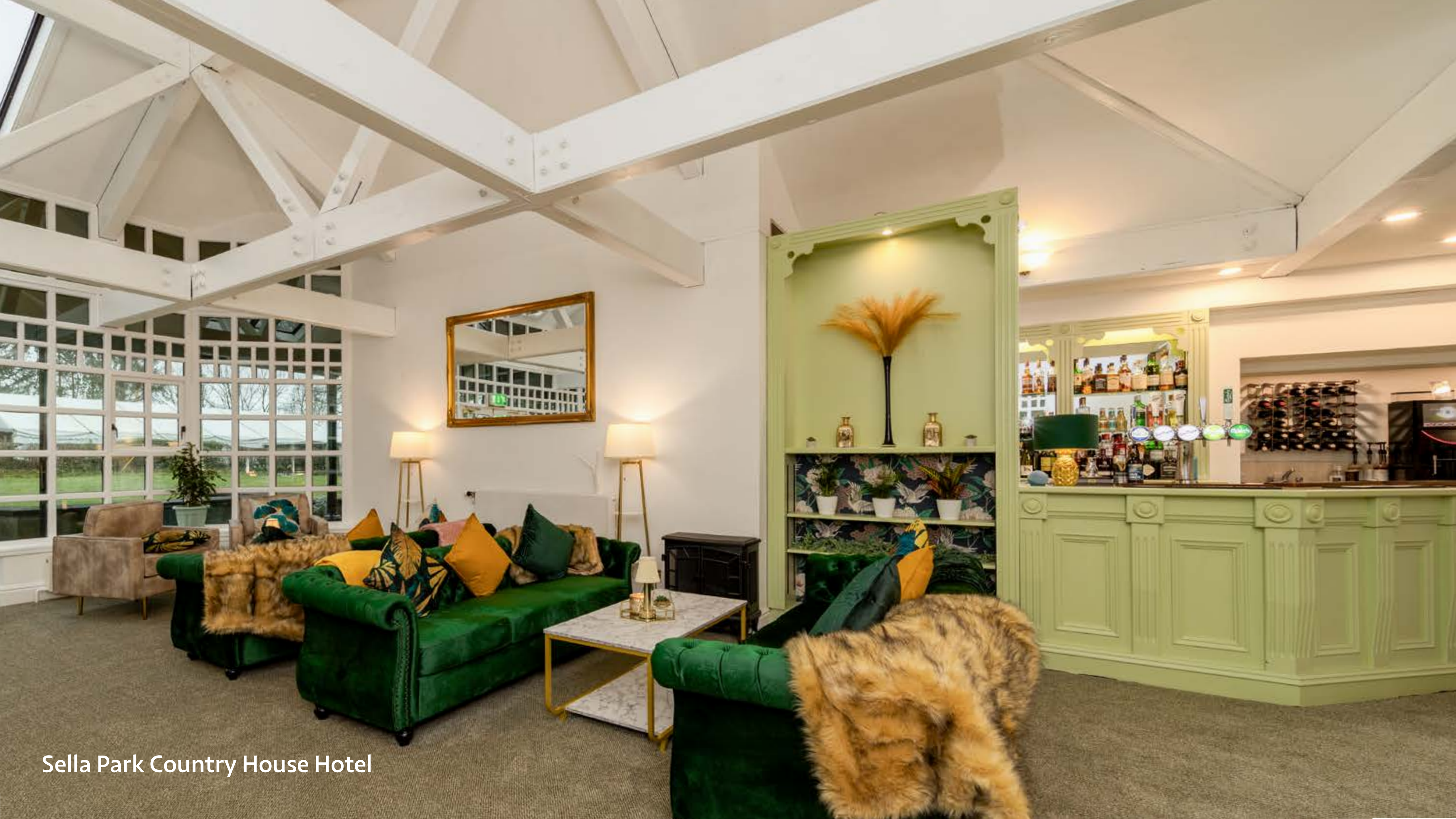
Sella Park Country House Hotel