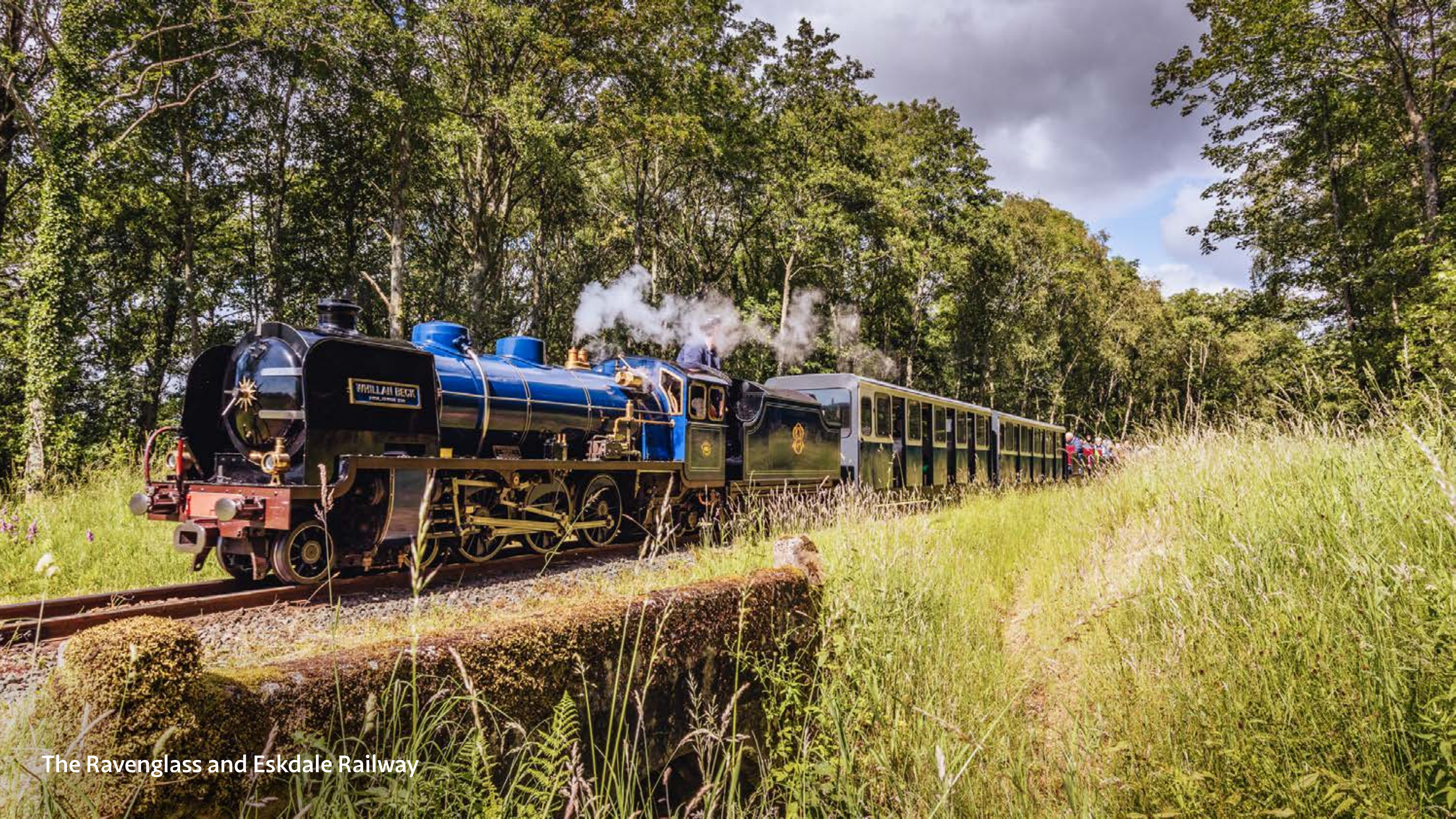
The Ravenglass and Eskdale Railway